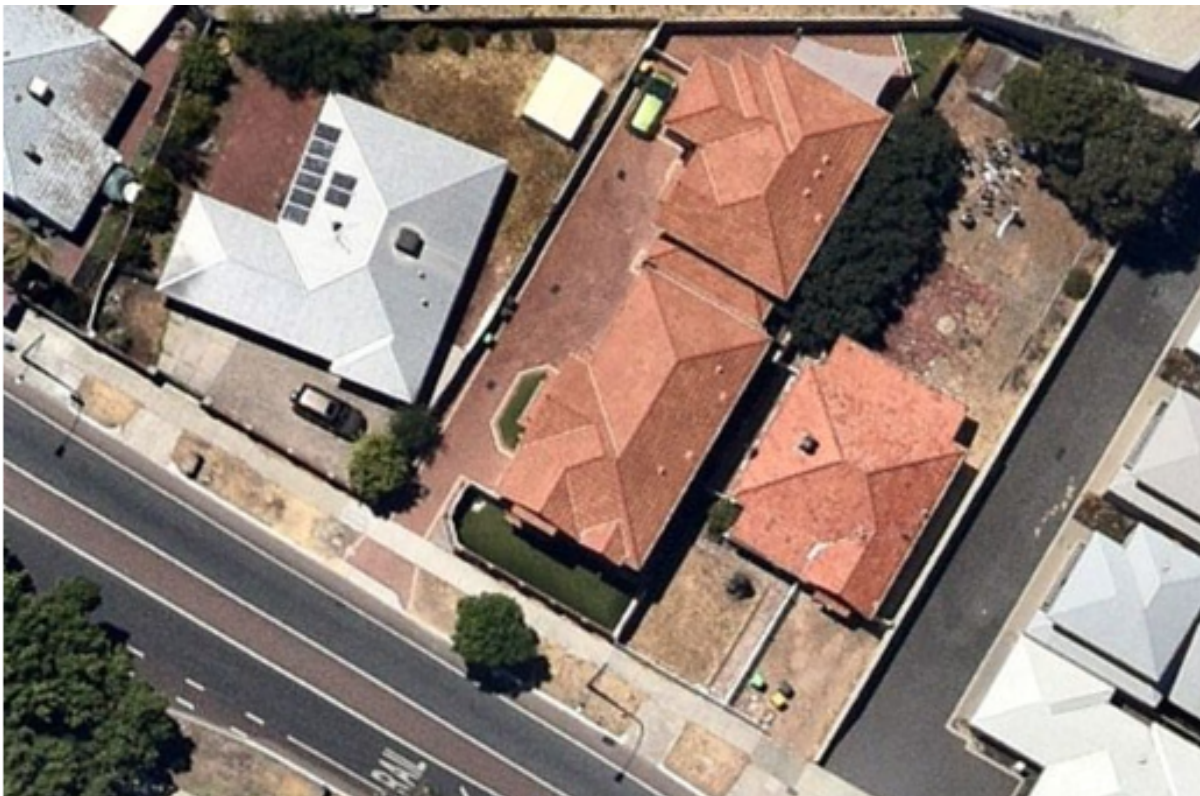
Below: Aerial photo of No 64, No 66 (a & b) and No 68 Oats Street, which would have their back yards overlooked by the proposed development.

16. Additional issues are commented on in the following section of this report. Noting that that Town is not the key assessing agency for this proposal, however, a comprehensive assessment of the proposal against the entirety of R-Codes Volume 2 has not been undertaken. Instead, Officers have limited themselves to higher level comments framed against the 10 Design Principles of SPP7.0